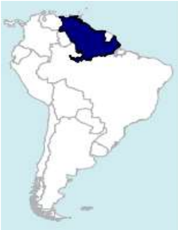
Map 2: Guiana Shield Hub IIRSA

The other projects within the Guiana Shield Hub IIRSA (Map 2), aims the integration between Brazilian states of Amazonas and Roraima with Guyana, consolidating infrastructure that links both countries. The projects seek the implementation and development of an integrational link in the far north of South America that connects Venezuela, Guyana and Suriname. Finally, these groups aim to consolidate an international physical connection between Guyana, Suriname and the Brazilian states of Amapá and Pará. However, out of the 15 projects that make up the 3 groups that are in Guiana, only the bridge over the Takutu River and roads from Linden to Georgetown are executed or running iv .